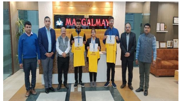
Winners of the Technical Poster Making