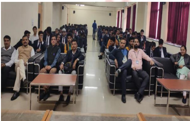
National Level Awareness Program (with MSME)

MIET-IIC in an effort to motivate research and start-up culture at MIET conducted "National Level Awareness Programme on Entrepreneurship (NLAP)" as part of "Azadi ka Amrit Mahotsav" in collaboration with MSME-DI, Okhla. The main focus of this session is to increase the knowledge and skill of existing entrepreneurs and encouraging become one. The session was attended by 180 students and more than 20 faculty members.