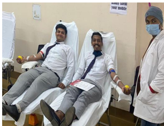
Students donating blood