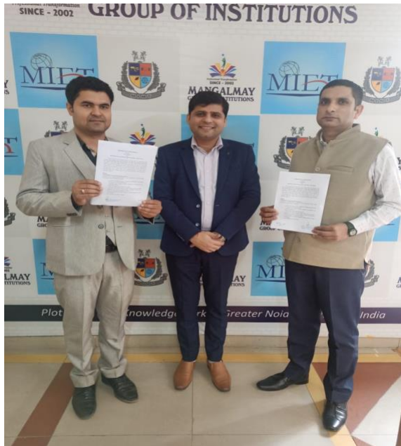
MIET & Cloud Kampus MoU

MIET has an excellent track record for providing excellence in education and development in society. The purpose of signing the MoU is Skill Development Program, Industry visits, Industrial trainings, guest lectures, to conduct Management Development Programs, Faculty Development Programs, Internships, and Live Projects for different branches.