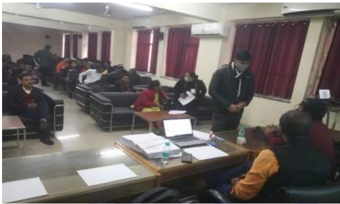
Voter ID camp

A drive was held at MIET campus to spread awareness regarding Voter ID on 23 rd Dec 2021 . The main objective of this program is to provide voter education, spreading voter awareness and promoting voter literacy in all age groups of the Indian citizens. Near about 300 students participated enthusiastically and faculty members.