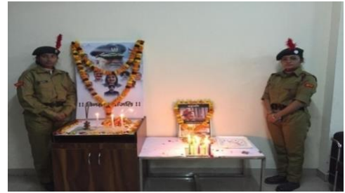
Tribute of Chief of Defence, Gen. Bipin Rawat and his team

On 15 th Dec 2021, the nation was shocked when it got to know that it had lost its beloved Chief of Defence, Gen. Bipin Rawat and his team in an air crash. The MIET family along with 32 Girls' Battalion N.C.C. cadets paid homage to the great figure and all those whom we had lost in the doomed air crash. Gen Bipin Rawat cared for his men and was a brilliant and professional soldier. His vision for the integrated central command is just what India needed at this time of insecurity around the world.