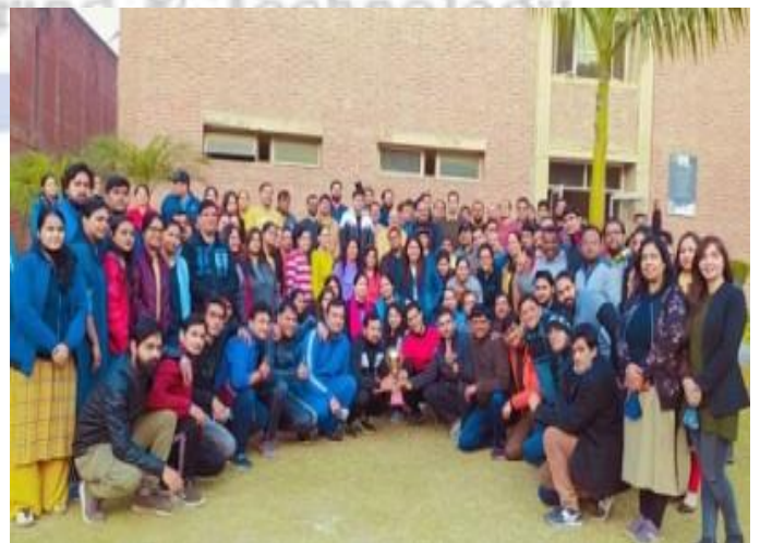
Annual Sports Day Celebration

MIET has been organizing Sports Celebration on last day of every year. In continuation of the same, MIET held Annual Sports Day Celebration on 31 st Dec. 2021 for all teaching and non-teaching staff, from all the departments.