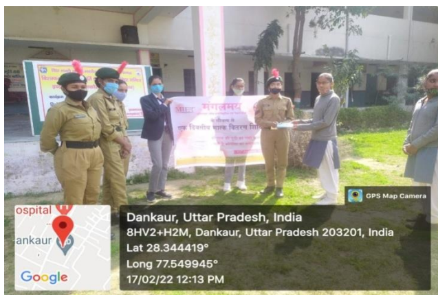
Day Mask Distribution Program in Greater Noida