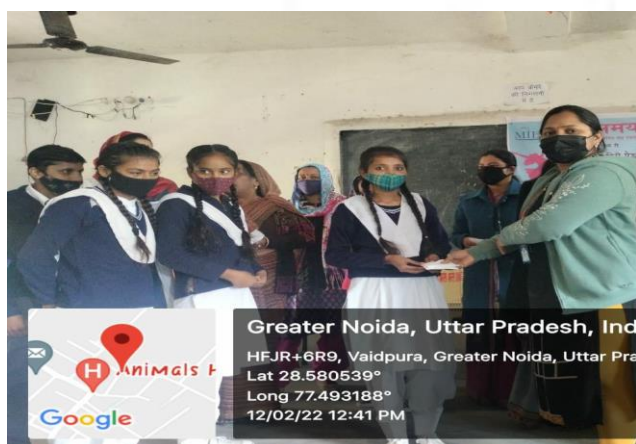
One Day Sanitary Pad Distribution Program