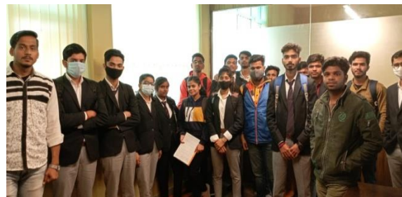
IIC -Virtual Incubation Programs

and NCR but across India through its " Virtual Incubation Programs ". MIEF focuses on supporting Startups in the domains like the United Nations program under SDG's, Education, Agriculture, Healthcare, Information Technology, Manufacturing & Engineering (IoT, AI, ML) and other areas of Social and National Interest. MIEF possess more than 10,000 sq. ft. of ready-to-use, built-up space with a seating capacity for more than 100 individuals. It includes the Fab Lab & Startup Office Space, Biotech & Innovation Labs, AI & ML Facility with Co-working Spaces. Also, the space homes office cubicles for Startups, various Meeting and Conference Rooms along with an Auditorium, Cafeteria, dedicated Parking & other facilities. Startups can leverage facilities such as laboratories, testing centre, highly experienced and knowledgeable faculty available through the R&D centre. Under this program, we support our incubated startups with facilities like initial brainstorming, furnishing ideas, consultancy, mentorship, networking, connecting to other subject matter experts, leading them to market access, in case if they get eligible, also connect/support with seed funding .