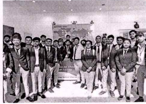
Second Day Photo-